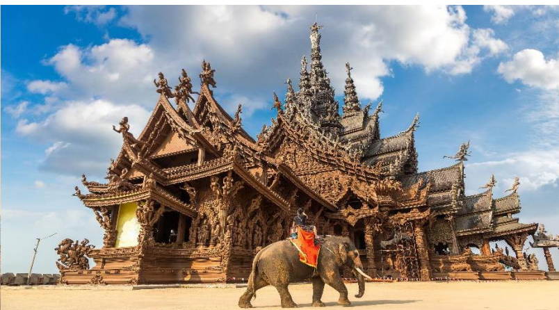
Thailand (Pattaya-Bangkok) 05 Days /04 Nights