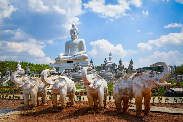
PHUKET – KRABI 06 Days/05 Nights