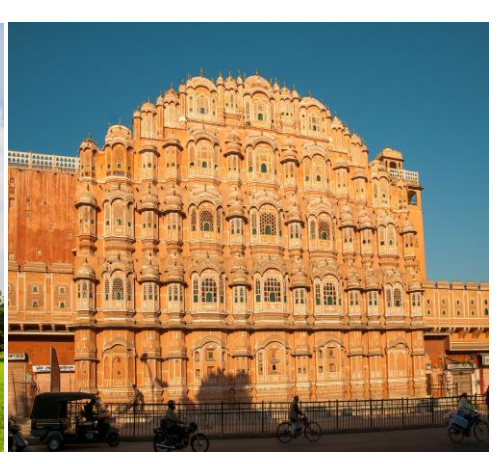
DELHI – AGRA – JAIPUR 07 Days/08 Nights