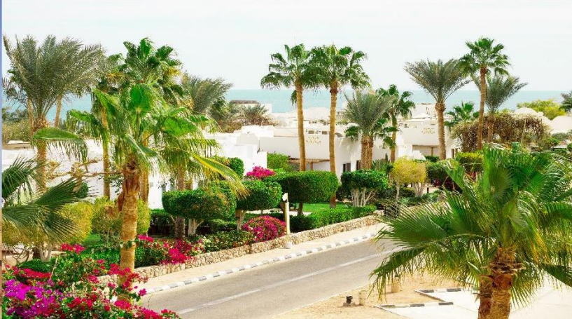
Egypt 08 Days / 07 Nights